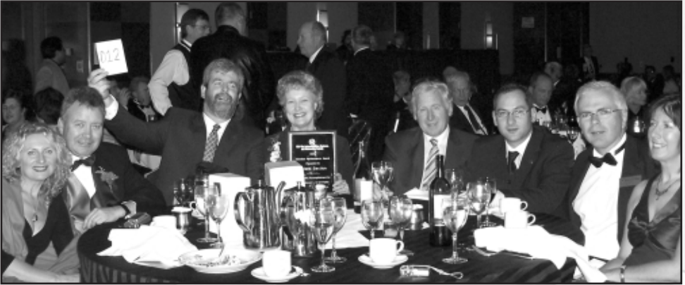
Ireland Section delegates & guests at the Honours & Awards Banquet with the plaque presented for our Membership Drive