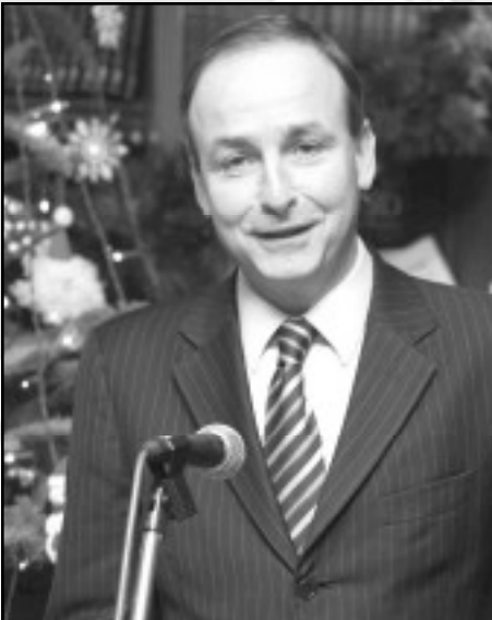
Minister for Enterprise, Trade and Employment, Michael Martin TD, at the Honours and Awards in UCC

Michael Martin TD Minister for Trade Enterprise and Employment opened the proceedings.