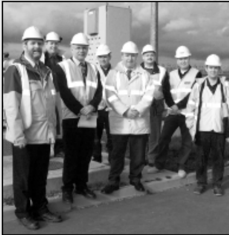
Attendees of waste water plant visit

The plant visit to 'Carrigrennan Waste Water Treatment Plant' took place on Wednesday 14th March 2007.