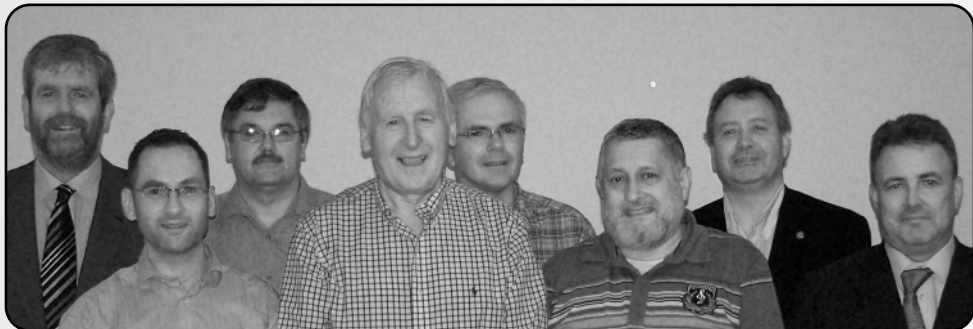
ISA committee for 2007/ 2008.